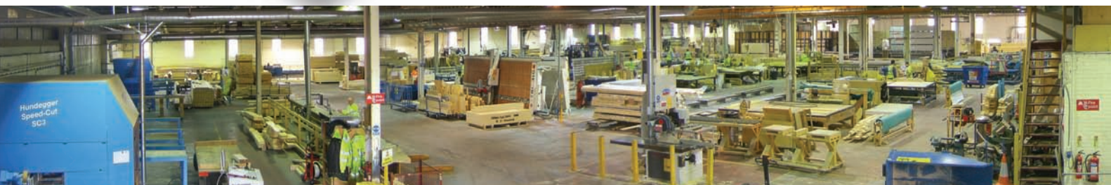
One of the largest fully automated timber frame manufacturing plants in the UK

90mm, 140mm 184mm, 235mm options U values from 0.26 - 0.10