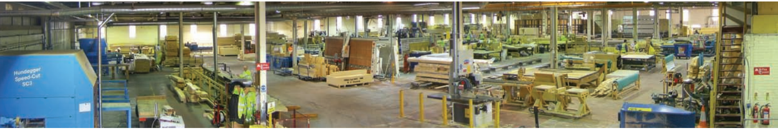
One of the largest fully automated timber frame manufacturing plants in the UK

90mm, 140mm 184mm, 235mm options U values from 0.26 - 0.10