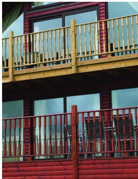
Timber frame lodges.